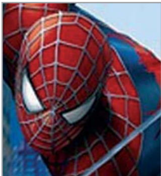
CPLG manages the rights of Spiderman 2

In August, Beringea sold its equity interest in Copyright Promotions Licensing Group (CPLG) to the company's management team. With the sale of CPLG, Beringea achieved a return of circa 2.5 times capital and an IRR of over 30%.